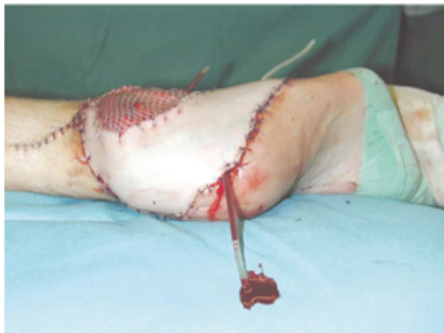
Figure 3. Arterial insufficiency of a lower extremity musculocutaneous flap. These flaps appear pale, demonstrate slow capillary refill, impaired turgor, are cool to touch, and have delayed bleeding with pinprick. Arterial flap failure may be due to: extrinsic factors, including pedicle twisting/kinking during transposition, pressure at the pedicle base, or pedicle compression from seroma and hematoma; or less commonly, intrinsic factors, such as arterial thrombosis during microvascular transfer.

ened by arterial insufficiency (Fig. 3), venous congestion (Fig. 4), and complete arterial or venous occlusion. Any surgically correctable etiology for flap compromise should be reversed as soon as it is discovered. HBO, however, can enhance flap survival when tissue damage persists despite no correctable etiology being found during surgical re-exploration.