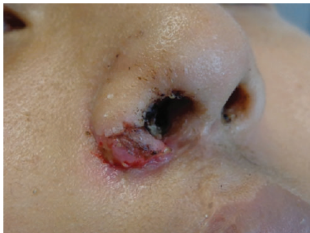
Figure 2. Composite graft failure following nasal reconstruction. Graft failure may be seen within 24–48 h. Clinically, threatened grafts may be characterized by a dusky appearance, epidermolysis, and ultimately necrosis. Prompt recognition is crucial.

Flaps, on the other hand, are units of tissue that carry their own inherent blood supply from the donor to the recipient site. They are susceptible to their own unique sources of compromise. Random-pattern flaps can undergo ischemia usually occurring distally—the area furthest from the source of vascular perfusion—if the flap length exceeds its vascular capabilities. Pedicled flaps can experience mechanical obstruction to blood flow, including pedicle kinking or twisting. Free tissue transfer, in which a flap is divided and transferred to a distant recipient bed with microsurgical reanastomosis, is susceptible to IR injury. All flaps may be threat-