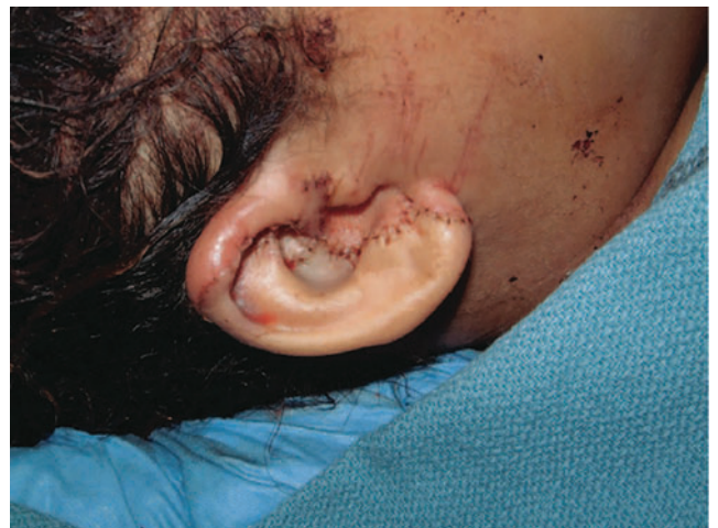
Figure 1. Reattachment of near-total ear amputation as a composite graft. This type of injury, resulting from a dog bite in this case, effectively produces a compromised graft due to large graft size and high metabolic demands due to the presence of multiple tissues. These limitations may be overcome by HBO. HBO, hyperbaric oxygen.

Grafts contain single or multiple tissue types (referred to as composite grafts) of varying size and depth that lack their own blood supply. The latter property makes these entities reliant upon their recipient bed for initial nutrient diffusion, revascularization, and ultimately, survival. This process of graft “take” follows a characteristic clinical progression, more noticeable in composite grafts. The