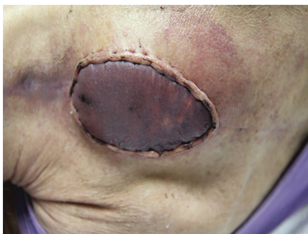
Figure 4. Venous congestion of a trunk musculocutaneous flap. These flaps appear blue to purple, demonstrate brisk capillary refill, increased turgor, are warm to palpation, and have dark prompt bleeding with pinprick. Venous congestion occurs more commonly than arterial insufficiency due to decreased vessel compliance and is the most common complication of microvascular transfer in the first 24 h.

ened by arterial insufficiency (Fig. 3), venous congestion (Fig. 4), and complete arterial or venous occlusion. Any surgically correctable etiology for flap compromise should be reversed as soon as it is discovered. HBO, however, can enhance flap survival when tissue damage persists despite no correctable etiology being found during surgical re-exploration.